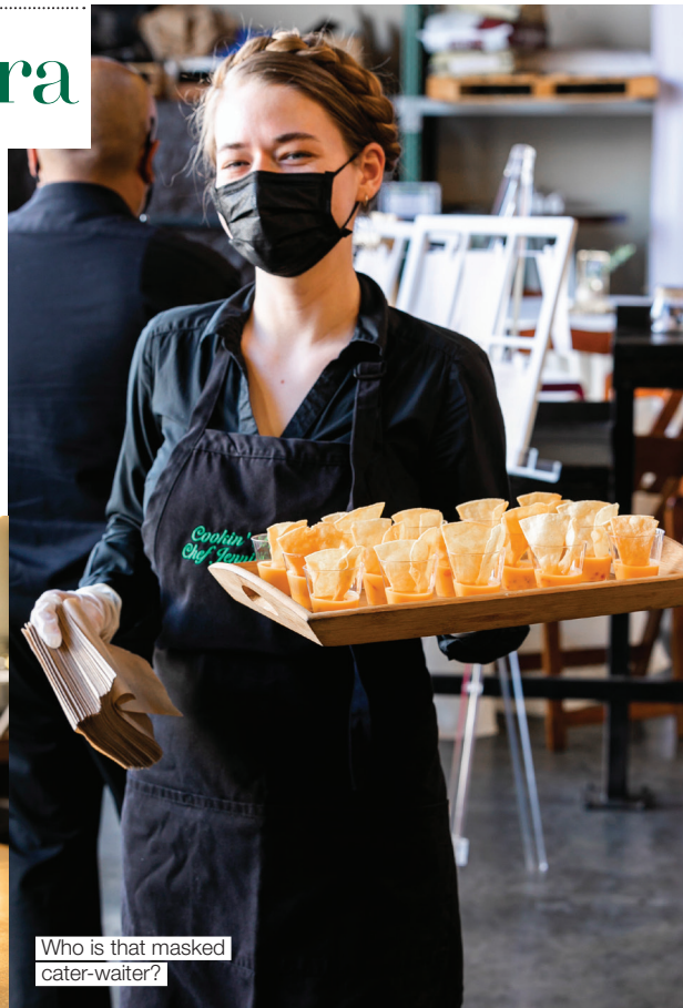
Who is that masked cater-waiter?