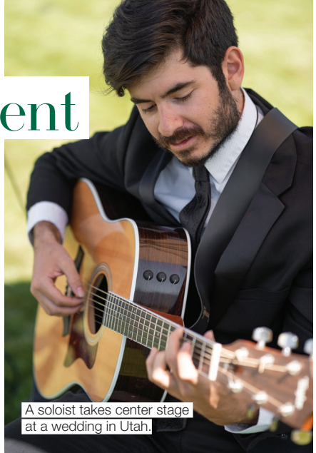
A soloist takes center stage at a wedding in Utah.