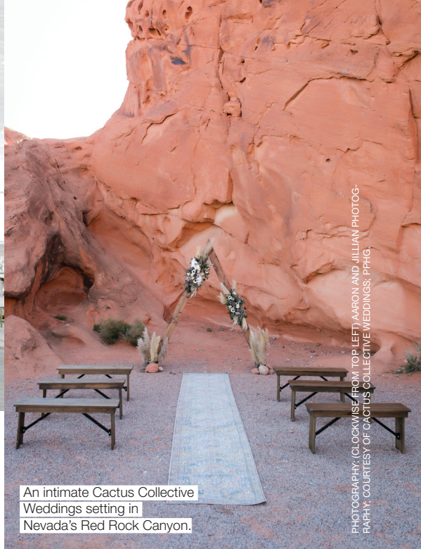
An intimate Cactus Collective Weddings setting in Nevada’s Red Rock Canyon.