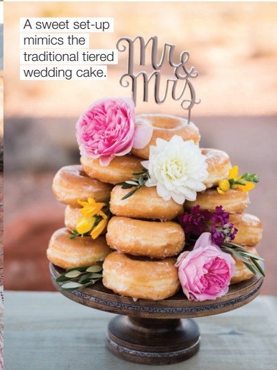
A sweet set-up mimics the traditional tiered wedding cake.

“We believe there is actually more focus on the ceremony now than there was before. Couples are realizing the true point of their wedding day. It’s more to say I do to the person you want to spend the rest of your life with—and less about the big party!”—Cheryl Stair