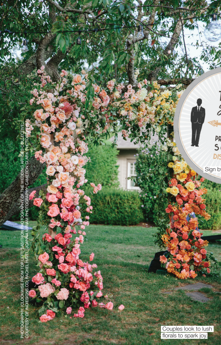
Couples look to lush florals to spark joy.