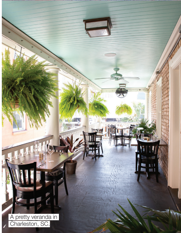
A pretty veranda in Charleston, SC.