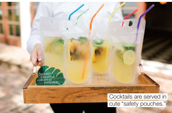
Cocktails are served in cute “safety pouches.”

including personal details that reflect their story as a couple. Some are serving drinks that are favorites of their siblings, or foods that would remind their families of their great-grandparents. Little details like that are definitely coming through in the planning process.”