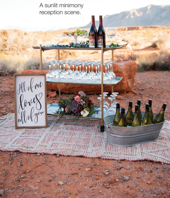
A sunlit mimimony reception scene.

• “More thought is put into self-service options like creative drink walls,” Pinon says. “Food is also more playful, presented in chic bento boxes and to-go containers. There is no finger food, everything is eaten with a fork (and knife where needed).” • “Smaller guest counts make the large wedding cake unnecessary, so couples are going for smaller cakes or mini tiers to cut for ceremonial purposes, then offering guests an array of other options,” says Bergmark. “Best practices are to not do dessert stations, but rather to plate a variety of mini desserts for each guest to enjoy at the table.” ■