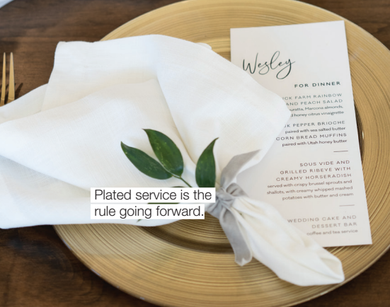
Plated service is the rule going forward.