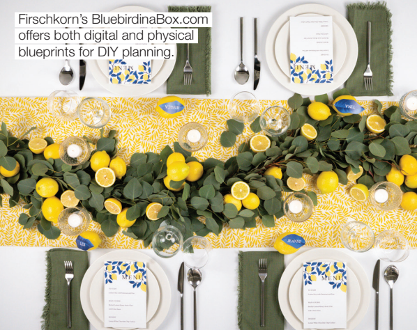
Firschkorn's BluebirdinaBox.com offers both digital and physical blueprints for DIY planning.