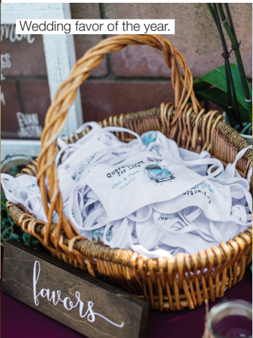
Wedding favor of the year.