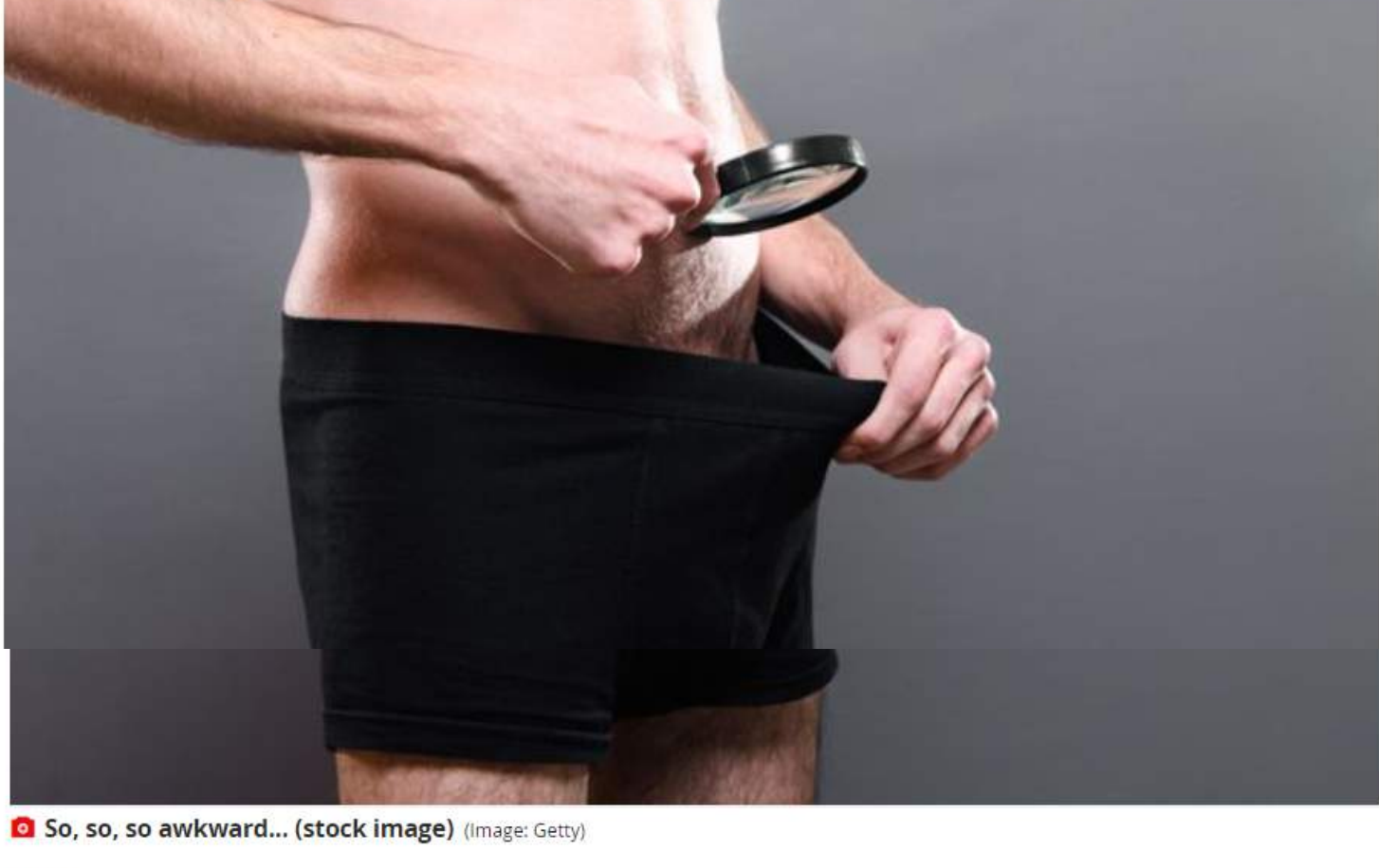
So, so, so awkward... (stock image)

What would you have done if you were him? Have your say in the comments section below.