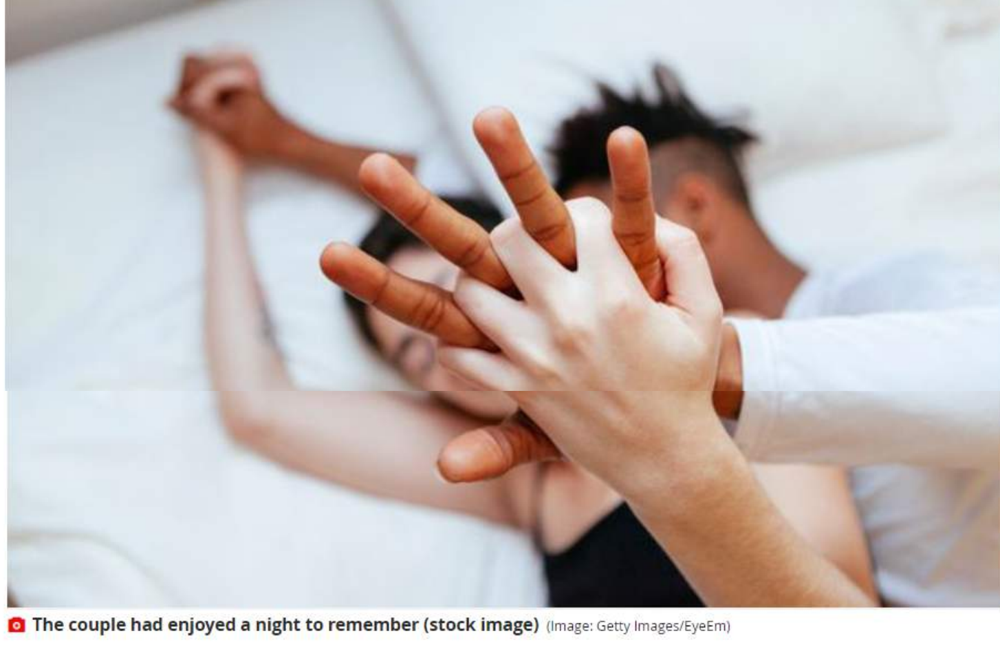
The couple had enjoyed a night to remember (stock image)

After dinner, we went dancing at a lounge that was playing reggae. We spent the rest of our date grinding on the dance floor and continuing to indulge in multiple drinks. We became hot and bothered and headed to her house. When we get to her place, we indulged in some outstanding sex. We stayed up laughing and talking until sun came up. Around 7am, I heard the front door open. My hot date didn't budge, so I asked if she had a roommate. She replied: "It's probably my kid's father." I hopped out of bed and got in defense mode, ready to fight if I needed to. The bedroom opened, and in came her baby's daddy. He stood about 6ft 4 tall, and I waited for the homey to bug up.