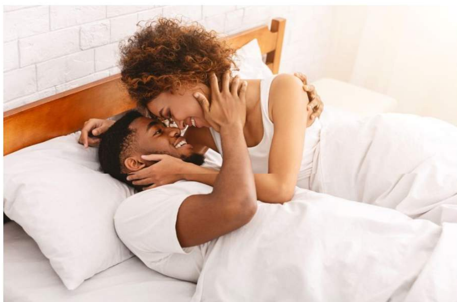
The date went brilliantly, but things took an embarrassing turn the following morning (stock image) (Image: Getty Images/Stockphoto)