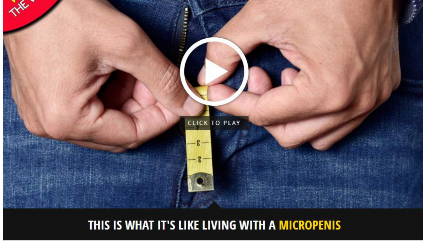
THIS IS WHAT IT'S LIKE LIVING WITH A MICROPENIS