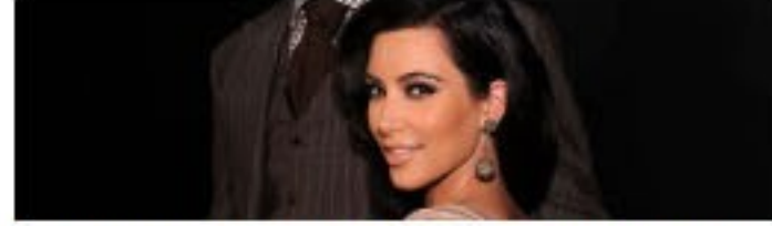
Kim Kardashian And Kris Humphries Divorce Trial Gets A Court Date