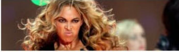
When Unflattering Celebrity Photos Go Viral