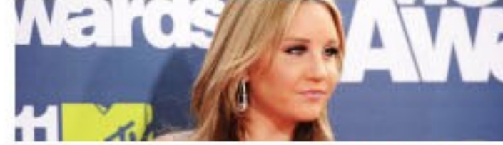
Amanda Bynes: 'My Goal Is To Weigh 100 Pounds'

Login with Facebook to see what your friends are reading