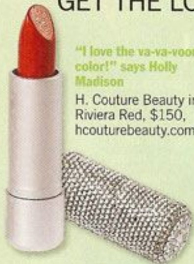
"I love the va-va-voom color!" says Holly Madison

H. Couture Beauty in Riviera Red, $150, hcouturebeauty.com