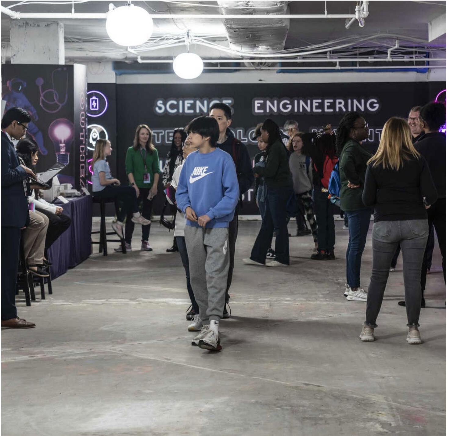
Attendees at the festival in Washington, D.C., checked out the science challenge's winning projects.